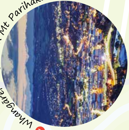
Whangārei City from Mt Parihaka