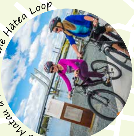
Te Matau ā Pohe on the Hātea Loop