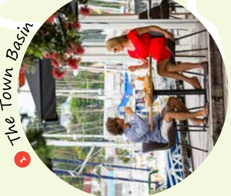
The Town Basin