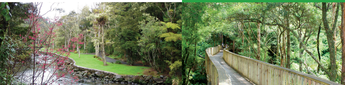
📷 HĀTEA RIVER WALK