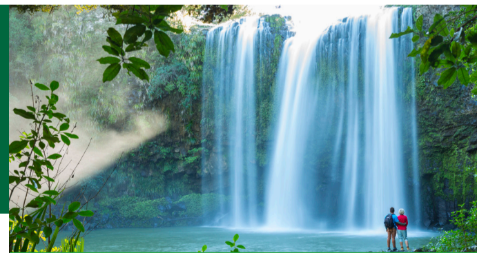
📷 OTUIHAU - WHANGĀREI FALLS